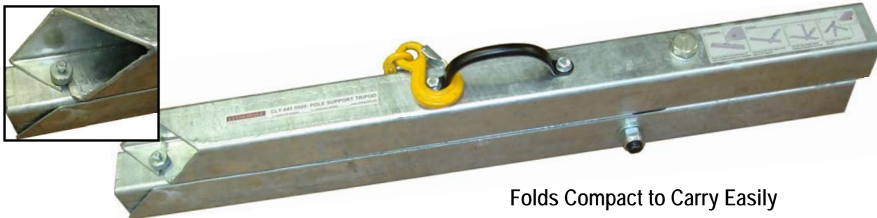
Folds Compact to Carry Easily

The new Clydesdale Pole Support tripod has been developed to provide a support to raise a pole of the ground for dressing / assembly work prior to erection in the field or depot. The tripod is manufactured from high quality carbon steel and hot dip galvanised for superior corrosion resistance. The unique design means the tripod can fold away neatly or be erected in seconds with no tools or assembly work required. To erect simple unscrew knurled locking nut, unfold and clip the chain in place. The tripod can be locked in the neat and compact folded position with a few turns of the knurled locking nut and easily carried with the large, robust carry handle.