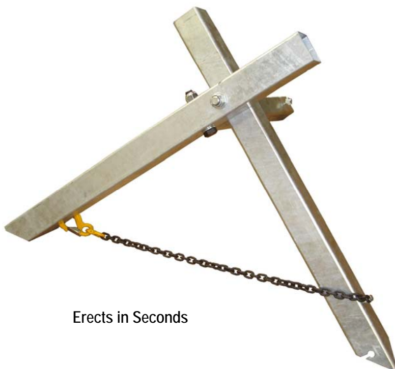
Erects in Seconds