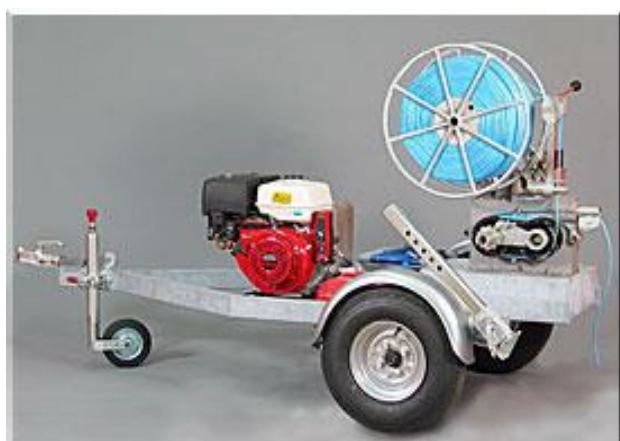
The line machine can be fitted with several different types of drums.