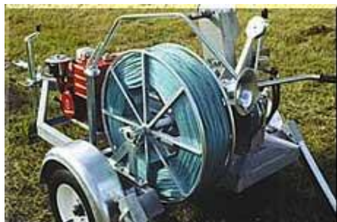
Many of the drums you have for your 204 winch can also be used for 210