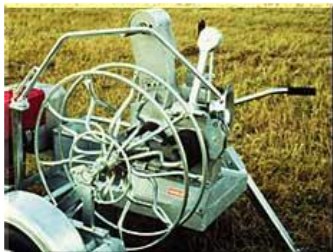
The drum here is a split drum for dismantling old line