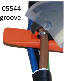
CLY 355 05544 Composite wedge with groove